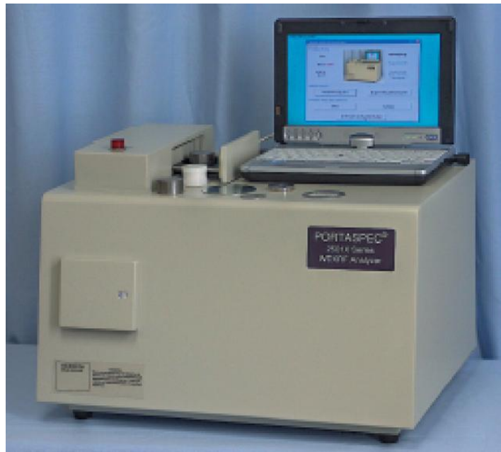
Benchtop WDXRF Analyzer, Portaspec 2501 XBT